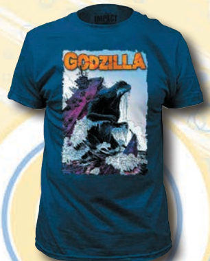
O/A GODZILLA: "AIRCRAFT CARRIED" NAVY T-SHIRT