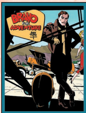
BRAVO FOR ADVENTURE HC IDW PUBLISHING