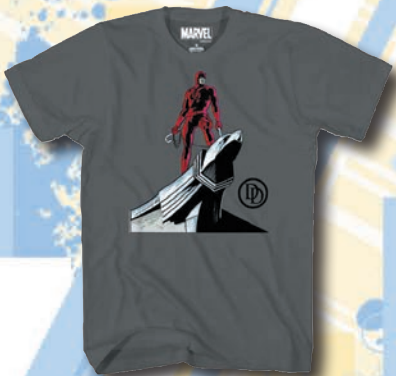
DAREDEVIL: "GARGOYLE" CHARCOAL T-SHIRT

Available only from your local comic shop!