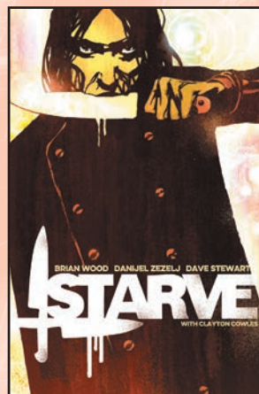
STARVE #1 IMAGE COMICS