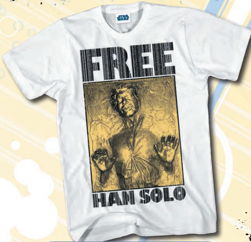
STAR WARS: "FREE HAN SOLO" WHITE T-SHIRT