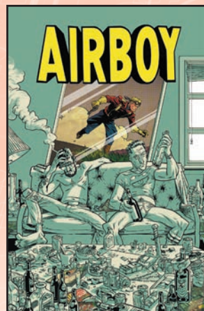
AIRBOY #1 IMAGE COMICS