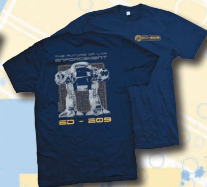
ROBOCOP: "FUTURE OF LAW ED-209" NAVY T-SHIRT