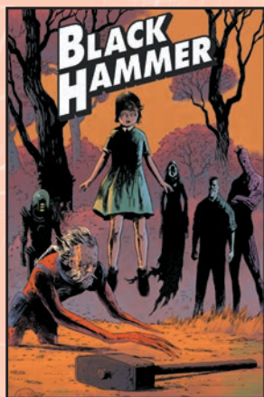
BLACK HAMMER #1 DARK HORSE COMICS