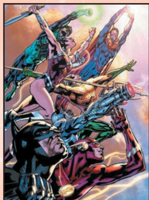
JUSTICE LEAGUE OF AMERICA #1 DC COMICS