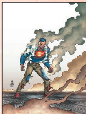
SUPERMAN #41 DC COMICS