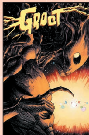
GROOT #1 MARVEL COMICS